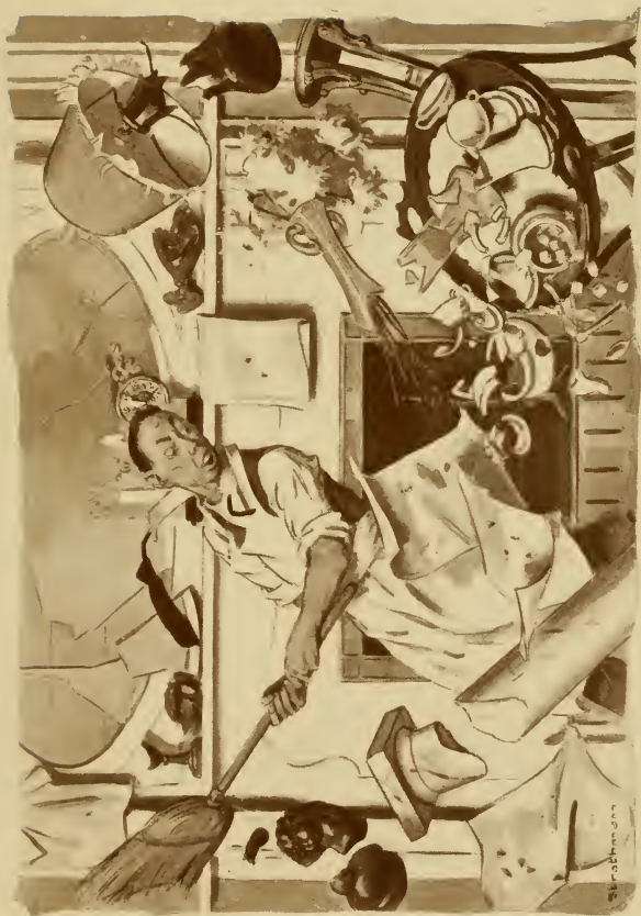
By this warfare I broke considerable flies and other dishes.